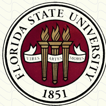
President of the University